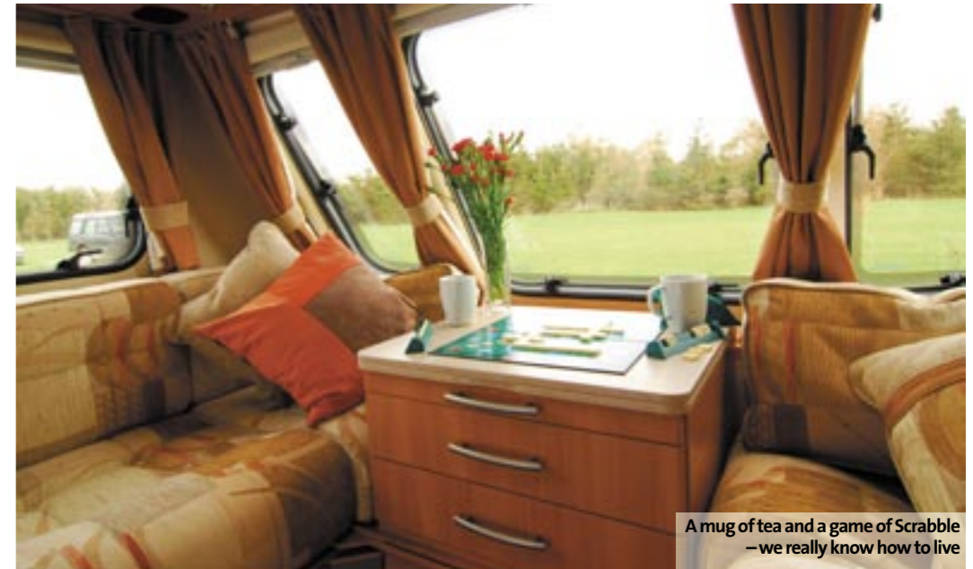
A mug of tea and a game of Scrabble – we really know how to live

If it's comfy enough for Jasper, that's good enough for us. And in the late afternoon sunshine, light floods into the bedroom through the side windows.